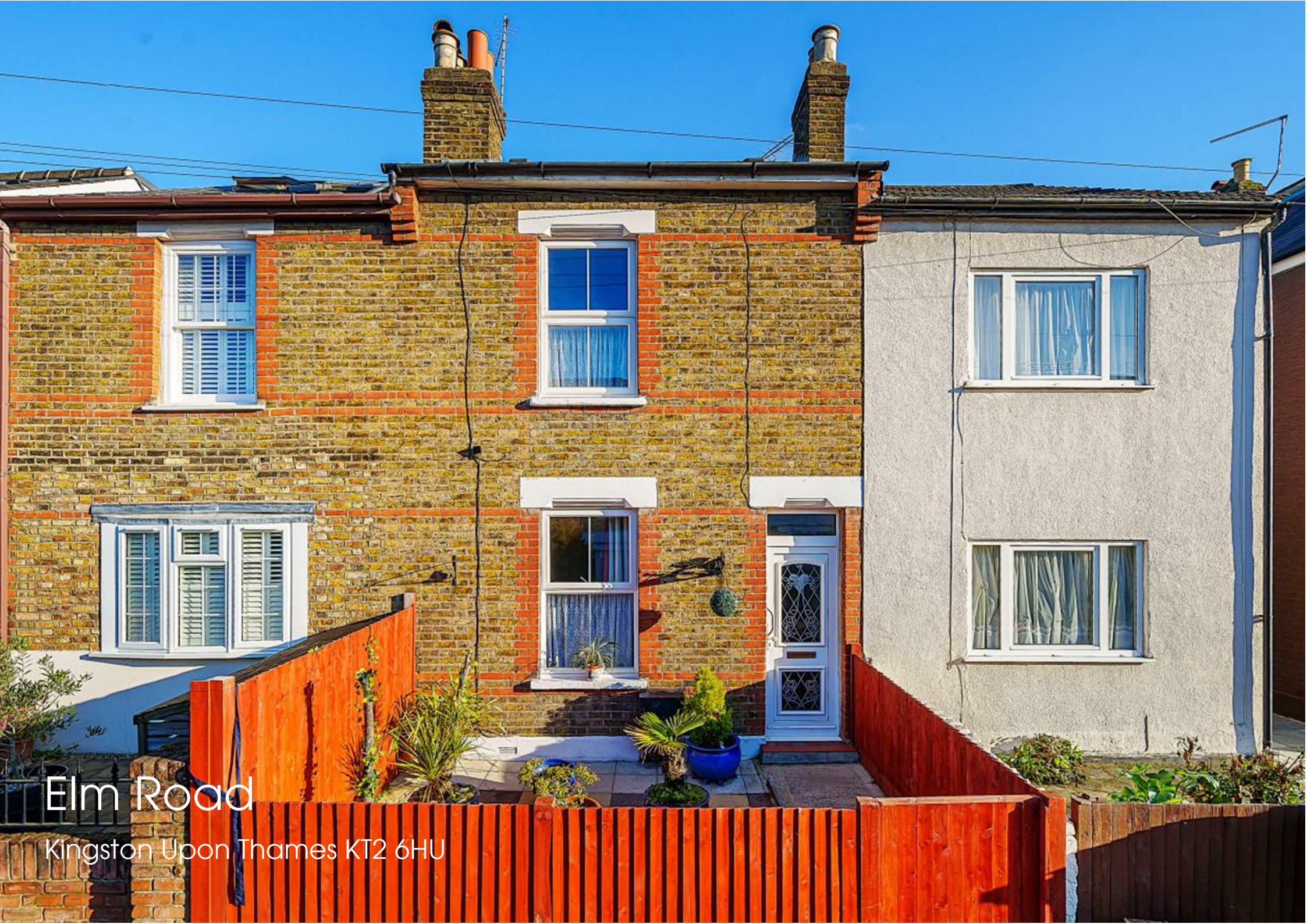
Elm Road Kingston Upon Thames KT2 6HU